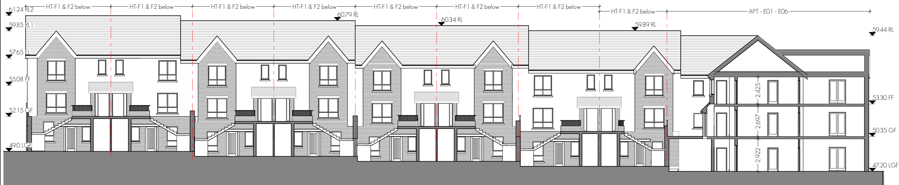
Contextual East Elevation - showing lower level 1:200